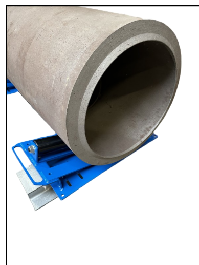
Single roller version for LENGTH rolling of the 24" pipe.