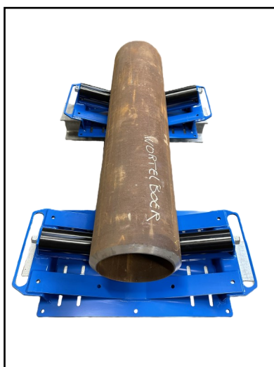
Single roller version for LENGTH rolling of the 10" pipe.

The roller block can be equipped with steel - blackened - rollers OR with steel rollers with a POLYURETHANE type P700 D coating of approx. 8.5 mm. thickness.